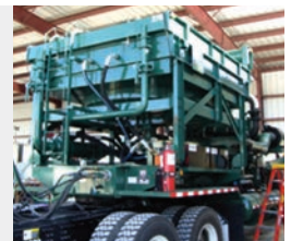
Custom horizontal well frac cooling module for Cummins QSK50