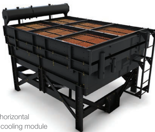
Custom horizontal well frac cooling module for CAT 3512C