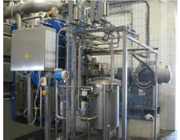
SIGMASTAR 90V MVR – Evaporating capacity: 2.000 kg/h